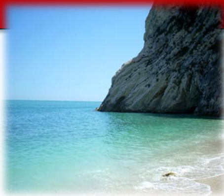
Due Sorelle beach, Ancona (AN)