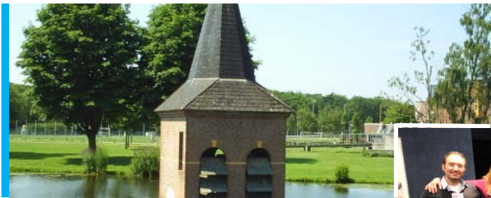
Torentje van Drienerlo in a campus lake

So all the ingredients have been brought together for a great week: We wish you to enjoy your Summer School!!