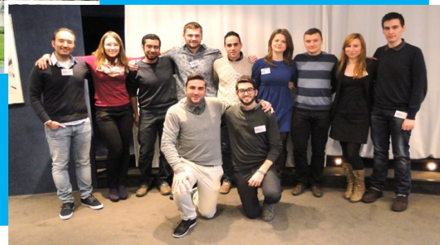
Meeting in Leipzig in February 2015 – The Bioart fellows