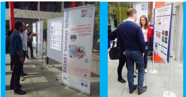
Summer School participants during the poster session