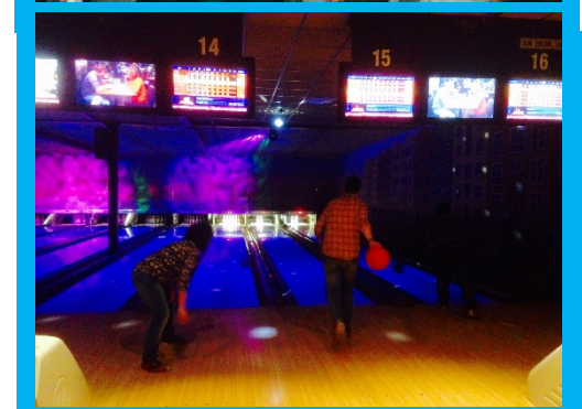
A SNEAK-PIC from last night bowling event.